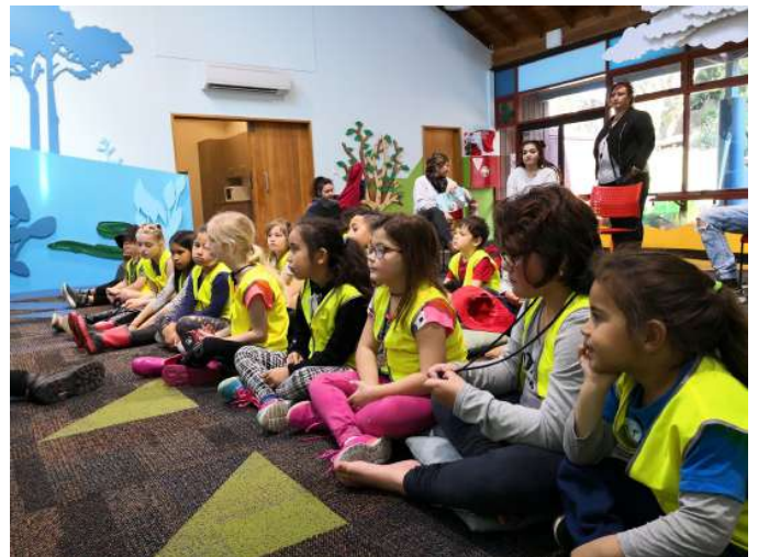
Last week the year 0 - 4 from Shannon School went on a trip to Wellington Zoo. It was an amazing experience full of wonderful sights, smells and sounds! Our tamariki came back absolutely buzzing from the encounters they had with all of the animals.