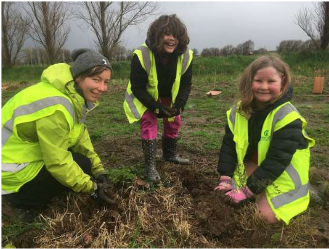
Earlier this term a group of Te Rito Hub learners had the opportunity to participate in a Riparian Restoration Planting event at Moutoa Farm. Although we didn't plant as many trees as we wanted due to the weather, we made a small contribution to the target of 7000 native trees planted.